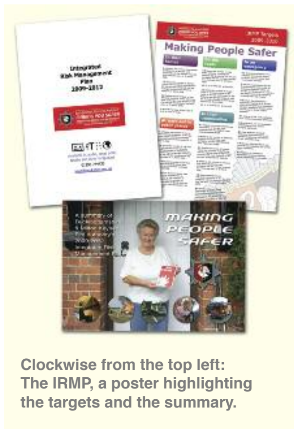
Clockwise from the top left: The IRMP, a poster highlighting the targets and the summary.

A 20-page summary was also produced to help make the Integrated Risk Management Plan even more accessible to a larger number of people.