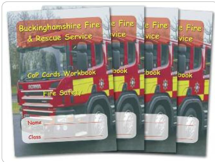
The Cop Card scheme for children aged 10 and 11 featured a Fire Safety work book.