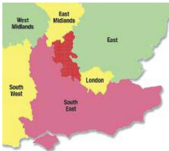
Buckinghamshire Fire & Rescue Service's position within the South East region.

We receive around 18,000 calls for assistance each year, of which about 8,000 are emergency incidents. Our emergency control centre employs 23 people who ensure 24-hour availability to