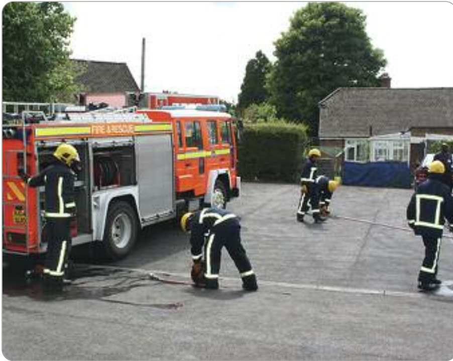
Pupils from The Cressex School are pictured taking part in a Sparx course at Princes Risborough Fire Station.