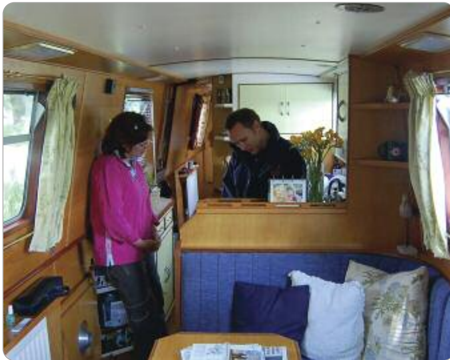
A firefighter carries out a boat safety check on the Grand Union Canal in Stoke Hammond as part of the activity planned around National Boat Safety Week.