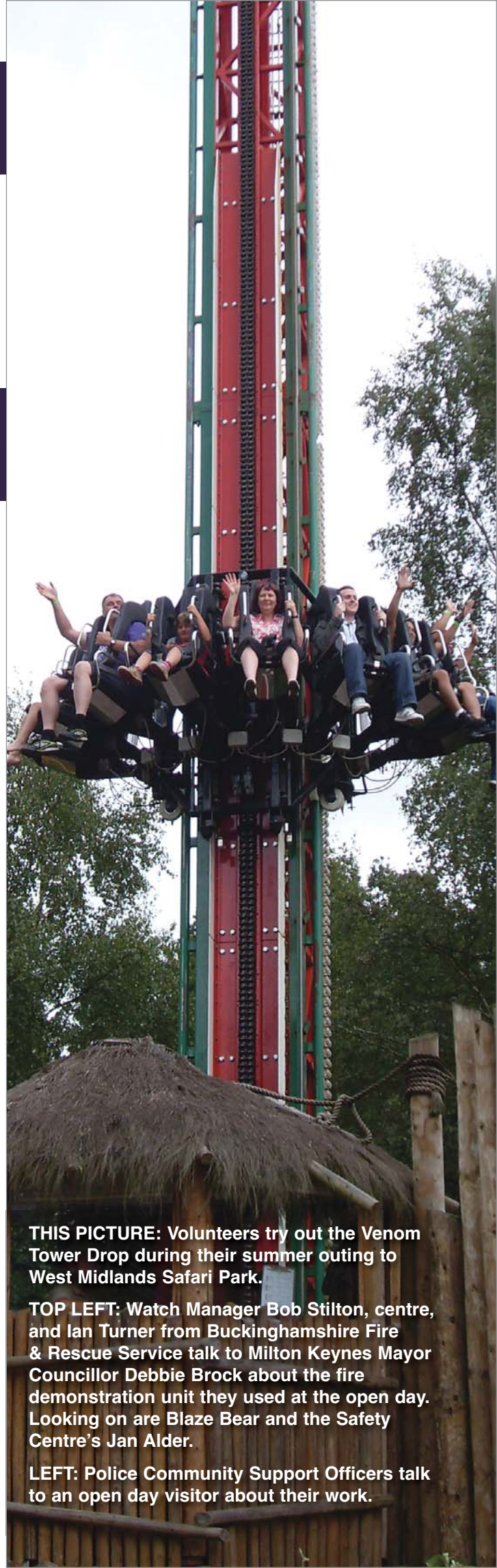
THIS PICTURE: Volunteers try out the Venom Tower Drop during their summer outing to West Midlands Safari Park.