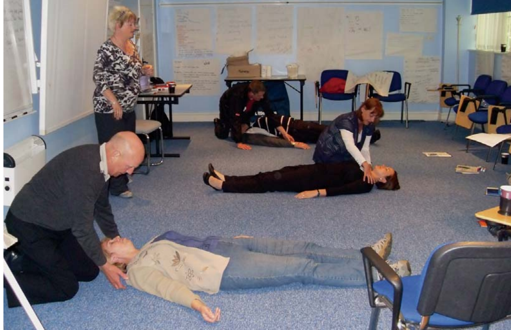
A First Aid course taking place in our conference room.