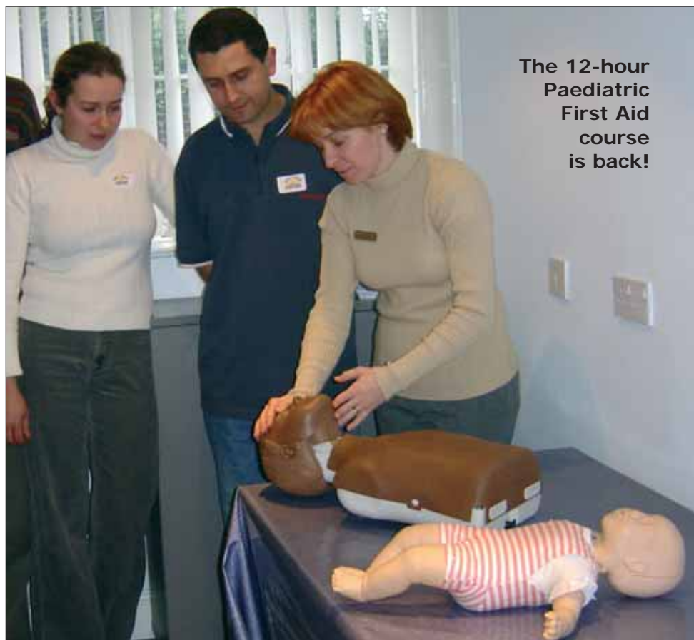
The 12-hour Paediatric First Aid course is back!

There is also the added bonus of knowing that you are supporting a worthwhile children's charity.