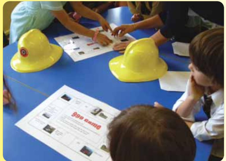
Right: The lessons feature a 999 game to help reinforce key messages.

FUNDING from Milton Keynes Council has allowed the Safety Centre to deliver classroom input for Year 2 pupils in Milton Keynes.