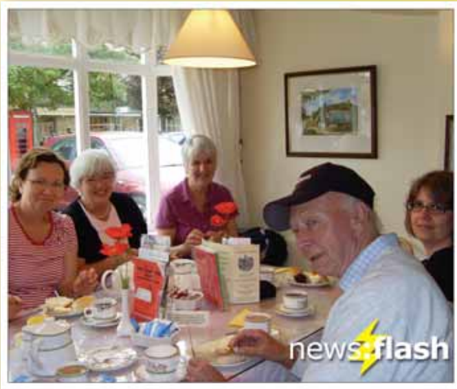
■ The Safety Centre's volunteers visited Bourton on the Water and Blenheim Palace for their summer outing in 2009.