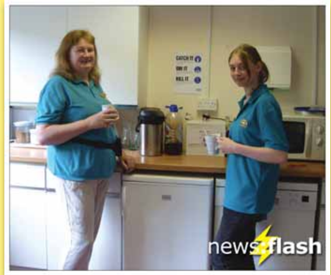
■ Many thanks to the John Lewis Partnership for their kind donation of a fridge for our volunteers' rest room.