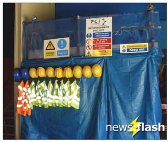
■ We strive to improve and update our scenarios whenever necessary. This is our new building site scenario, complete with hard hats!