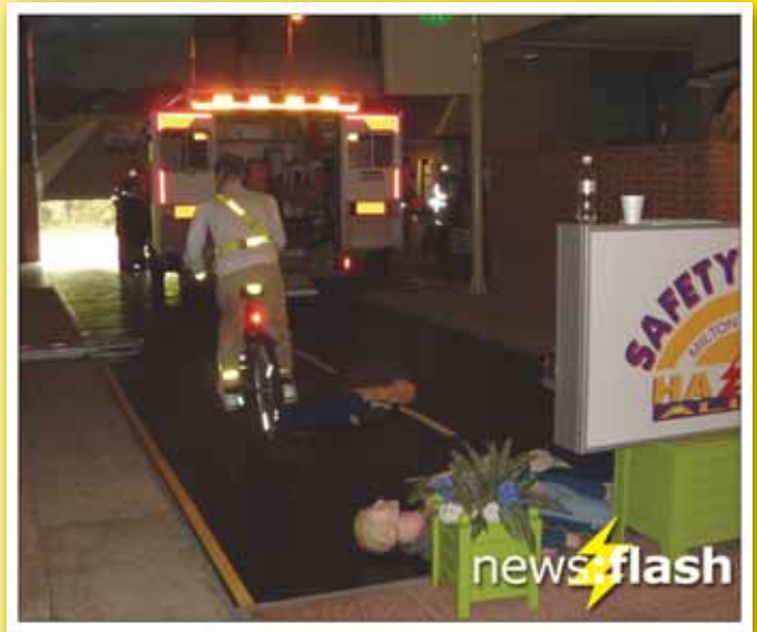
■ The Safety Centre was hired for a day by the East of England Ambulance Service, who trained their paramedic using our lifelike scenarios.